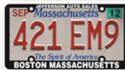
Plate Frames As Low As $ .59

Up to 2 Free Proofs Just Give Us A Call For Pricing